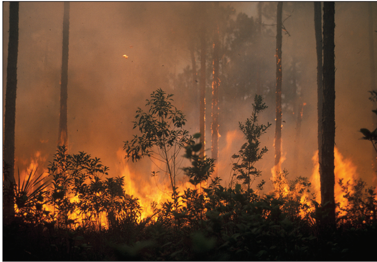
Figure 1. Ingraham fire (1989) in Everglades pine savannas, west of Long Pine Key, during the transition period from dry to wet season. Transition fires are important for the maintenance of savannas and associated indigenous herbaceous plant species in the diverse ground cover by removing litter and top-killing woody subtropical species.