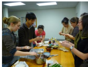
Making Chinese ravioli together

Chinese Cuisine Time, which is open to Chinese House members only due to the limited space.