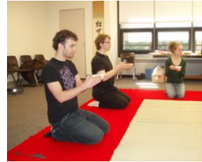
Japanese Tea Ceremony Workshop

10/30 (F) 11:30-12:45 CM305, L/L. "Japanese Flower Arranging" workshop by Kimiko Yumoto (Kazuko.Suzuki@uvm.edu for registration; nominal fee collected at workshop)