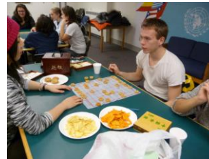
Improving one's planning and strategic skills by playing Chinese chess and the go

However, other activities such as the Chinese game nights are open to everyone.