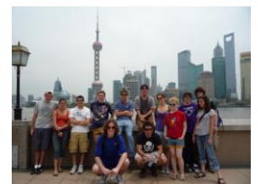
During a study tour at Shanghai, China