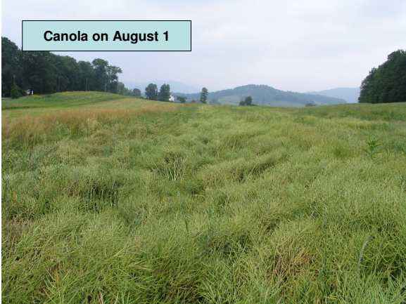
Canola on August 1