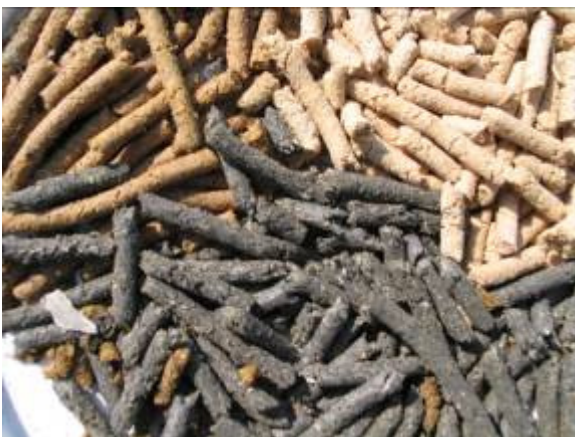
(canola, soy, and sunflower meal, above)

Protein is typically an expensive nutrient in many animal diets, and therefore, feeds containing 30-60% available protein (as these by-products contain) can be valuable commodities. The protein quality of these by-products still needs to be assessed because the amino acid profile and true protein content of these particular by-products have yet to be determined. Protein quality, and the willingness to further process the by-product ingredient could influence the suitability of these ingredients for some animal species.