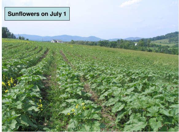
Sunflowers on July 1