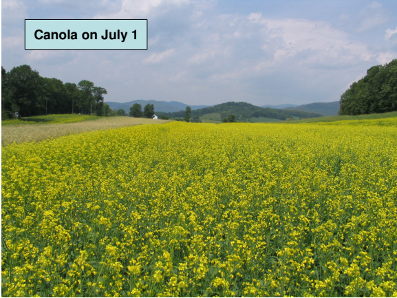
Canola on July 1