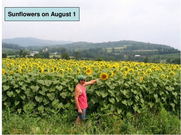
Sunflowers on August 1