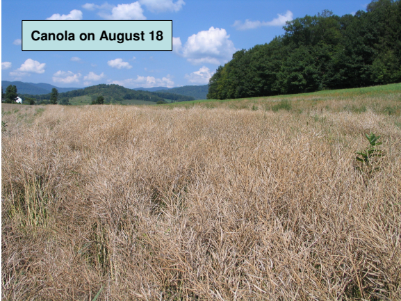
Canola on August 18