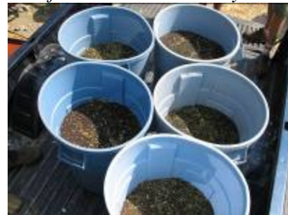
seeds from a canola variety trial

Canola varieties and related issues. The canola varieties grown in these trials included KAB, which was untreated hybrid seed. Varieties 601 and Oscar were untreated and open pollinated, meaning that farmers could save their own seed from these crops. Hyola 401 and Hyola 420 were treated hybrids.