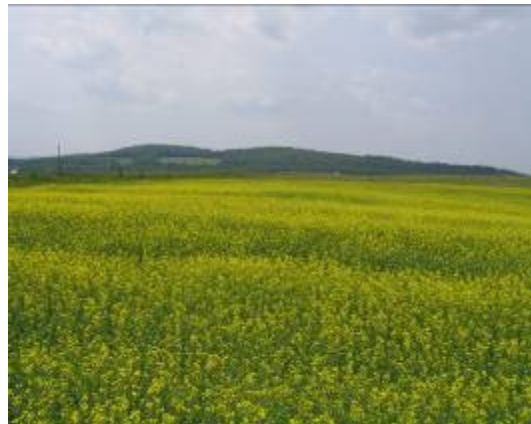
Field of oil seed mustard, Shaftsbury 2006