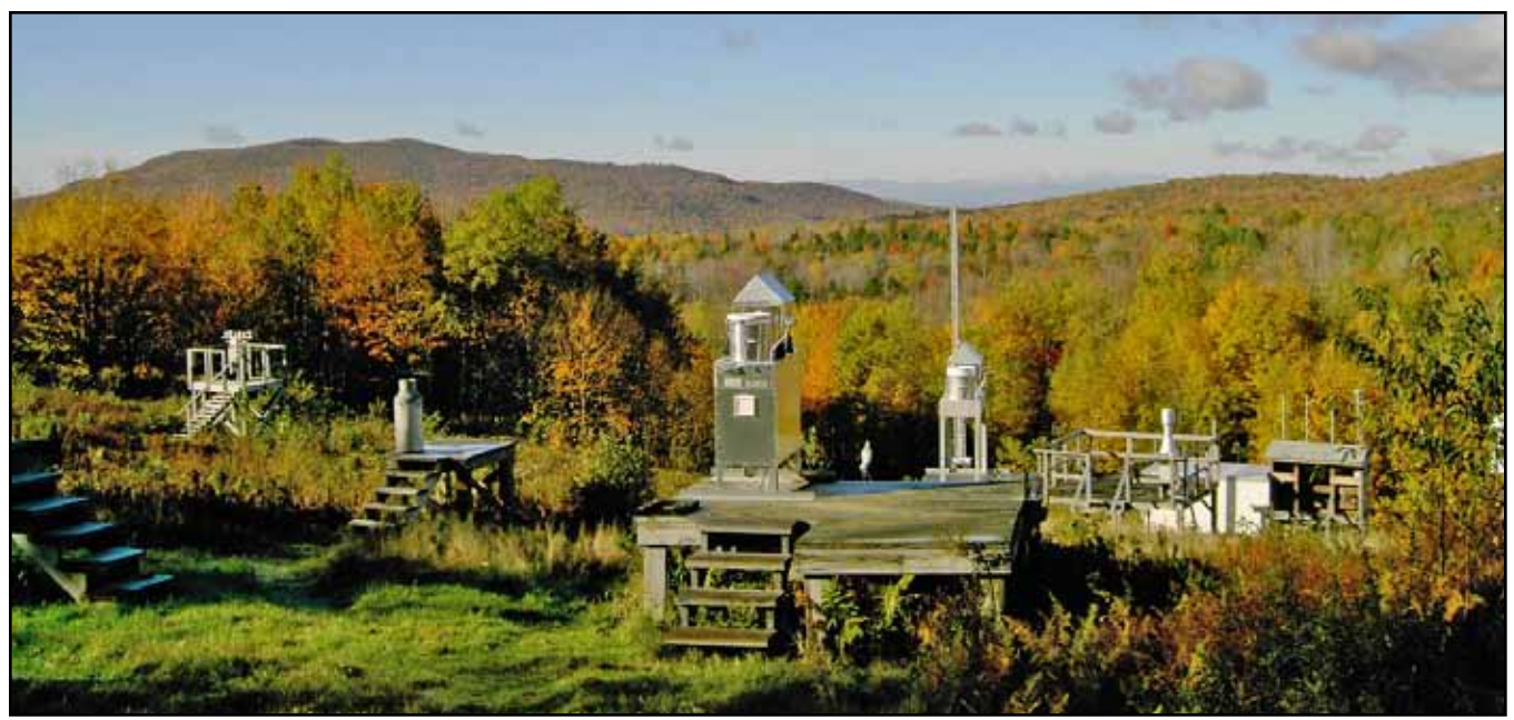
VMC's air quality monitoring site at Proctor Maple Research Center in Underhill, Vermont.

The AIRMoN-Wet station at the VMC air quality site started operation on January 27, 1993 and has operated continuously since then. Data from the site are available online at the NADP website: <u>http://nadp.sws.uiuc.edu</u>. Recent requests for data specifically from our site in Underhill (VT99) totaled 192 in 2006 and 133 in 2007. For 2008, there were 89 requests as of July 27<sup>th</sup>. Again, these