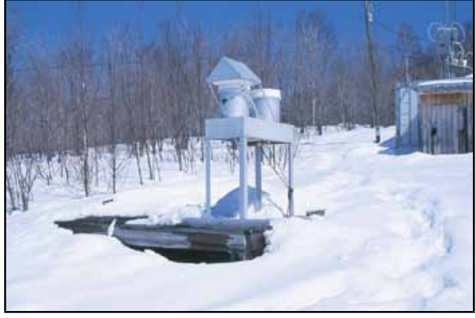
Aerochem precipitation collector used to collect AIRMON precipitation samples at the Proctor Maple Research Center's Air Quality site.

base research or see the effects of clean air legislation, it is nearly impossible to understand what is really going on at the ecosystem level.