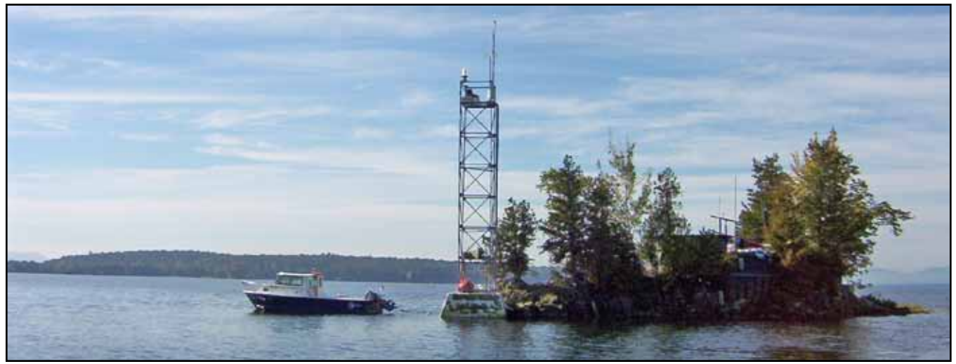
Diamond Island meteorological station on top of Coast Guard navigational tower on Lake Champlain.

MMW is equipped with a data radio, and data are automatically downloaded from the site every four hours. These data are archived and published on the Burlington Eco Info website at: <u>www.uvm.edu/~empact/weather.php3</u>. MME does not have line-of-sight to our base station located at the Rubenstein Laboratory on the Lake Champlain waterfront, so direct data radio transmissions are not possible. Although, the possibility of establishing a repeater station and additional "summit" meteorological station at the top of Mt. Mansfield do appear feasible, based on a field test conducted in 2005, this additional station would require approval from the Mt. Mansfield Co-location Committee in what can be a lengthy process. For now this is a