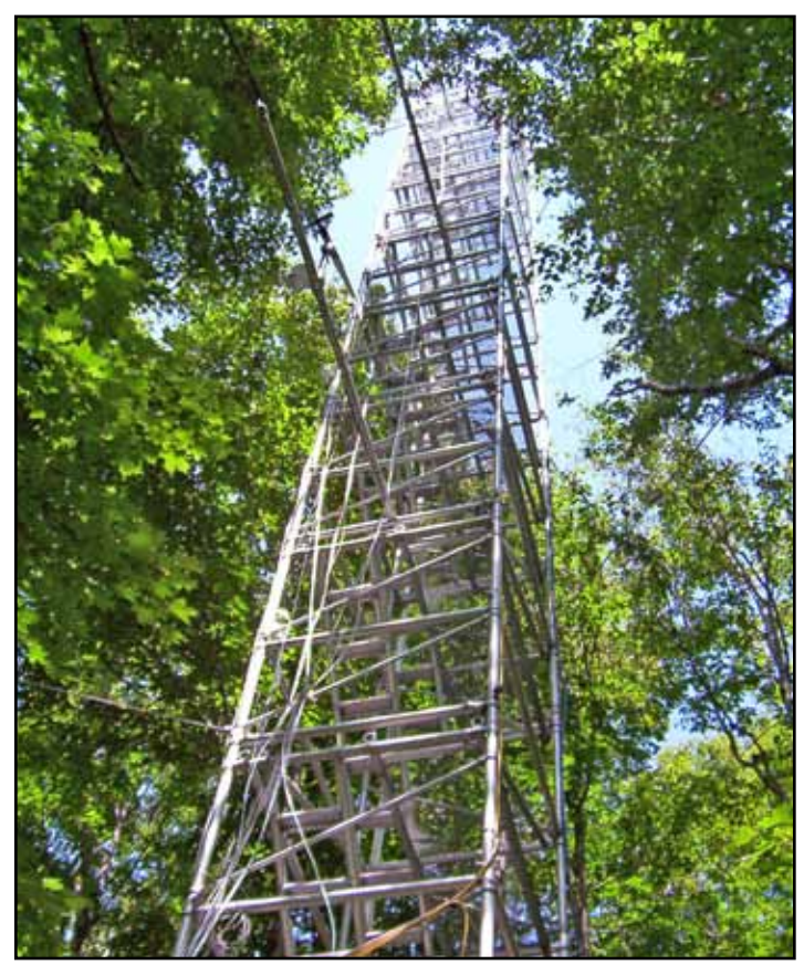
VMC's 66-foot walk-up forest canopy tower at Proctor Maple Research Center in Underhill, Vermont.

VMC's Tower meteorological station, established in 1992, is perhaps the most unique because of its, original five, now four micrometeorological stations located along an elevational gradient below and above a mixed hardwood forest canopy (See Figure 1 for list of variables collected.) As many of you know, meteorological data were collected continuously from the Tower site from July 1992 until early December 2004 when the forest canopy tower blew over as the result of severe winds and saturated soil conditions around the guy wire anchors. The tower was rebuilt in early October 2005, but the micrometeorological stations were not completed until November 2006 when all instru-