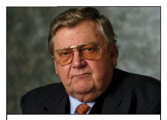
Foreign Affairs After Sept. 11 Former Secretary of State Lawrence Eagleburger will outline his views on American foreign policy and the war on terrorism on April 2, at 4 p.m., in Ira Allen Chapel. For more information, see the story below. (Publicity photo.)