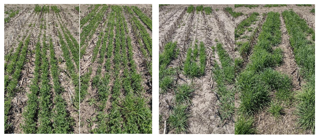
Images 1-4 (left to right). Alfalfa in 30-inch and 60-inch rows, orchardgrass in 30-inch and 60-inch rows.

Maintaining adequate corn populations while increasing row widths can be a challenge in these systems. In this trial, the populations were over 5,000 and 6,000 plants ac^{-1} lower in the 60-inch plots compared to the 30- and 40-inch plots respectively. Seeding rates and planting equipment need to be adjusted appropriately to achieve optimal seeding rates at these wider row spacings. In the end, corn silage yields were five- and four-tons ac^{-1} higher in the 30-inch rows compared to the 40- and 60-inch rows respectively. The fact that the corn populations were lower in the 60-inch rows, but yields were similar to the 40-inch rows, suggests that the plants were able to compensate the lower populations.