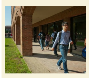
Kalkin Hall 55 Colchester Avenue Burlington, Vermont 05405