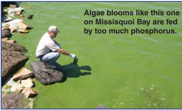
Algae blooms like this one on Missisquoi Bay are fed by too much phosphorus.