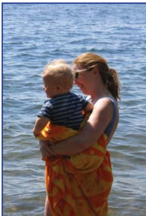
Your lawn care affects the health of local water!

The solution is to create healthy soil and grass for an attractive and lake-friendly lawn. Healthy soils include organic matter and a soil structure that supports a microbe community to help release nutrients and combat fungal pests. To keep grass healthy, don't stress it by over watering or mowing it too short. It will then be better able to tolerate pests and out compete weeds.