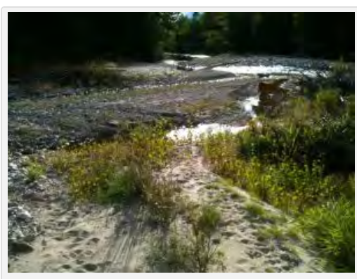
The physical features of riverbeds continually change with cycles of flooding.

Riparian buffers retain strips of natural vegetation along riverbanks, generally 20 to 50 feet wide. They mimic larger riparian ecosystems, like the ones that protected Middlebury during Irene, and allow natural river processes and communities of life adapted to floodplains to continue within agricultural landscapes. Buffers improve water quality, in particular, by acting as giant filters. High levels of nitrogen and phosphorus in agricultural runoff can disrupt river food webs and cause algae blooms. The trees, shrubs, and perennial herbs and grasses in riparian buffers slow overland water movement, allowing sediments and nutrients to deposit into the soil and keeping pollutants out of waterways. The root