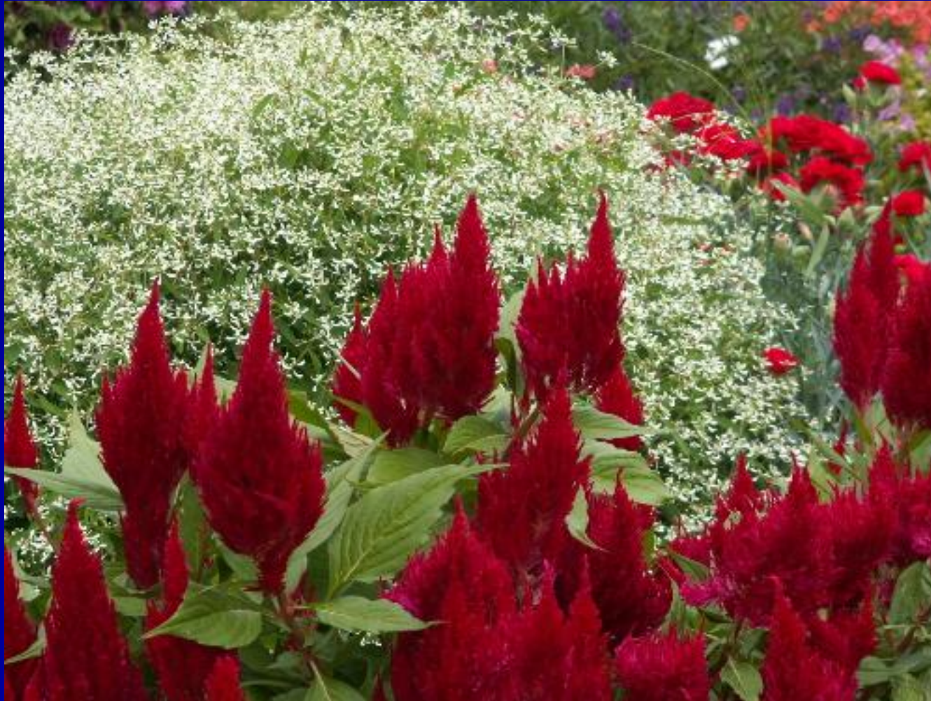
Celosia 'Fresh Look Red' (2004), Euphorbia 'Diamond Frost'