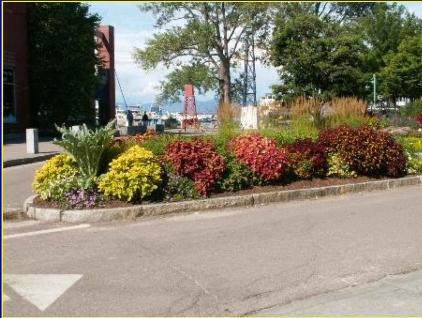
Front bed 2008