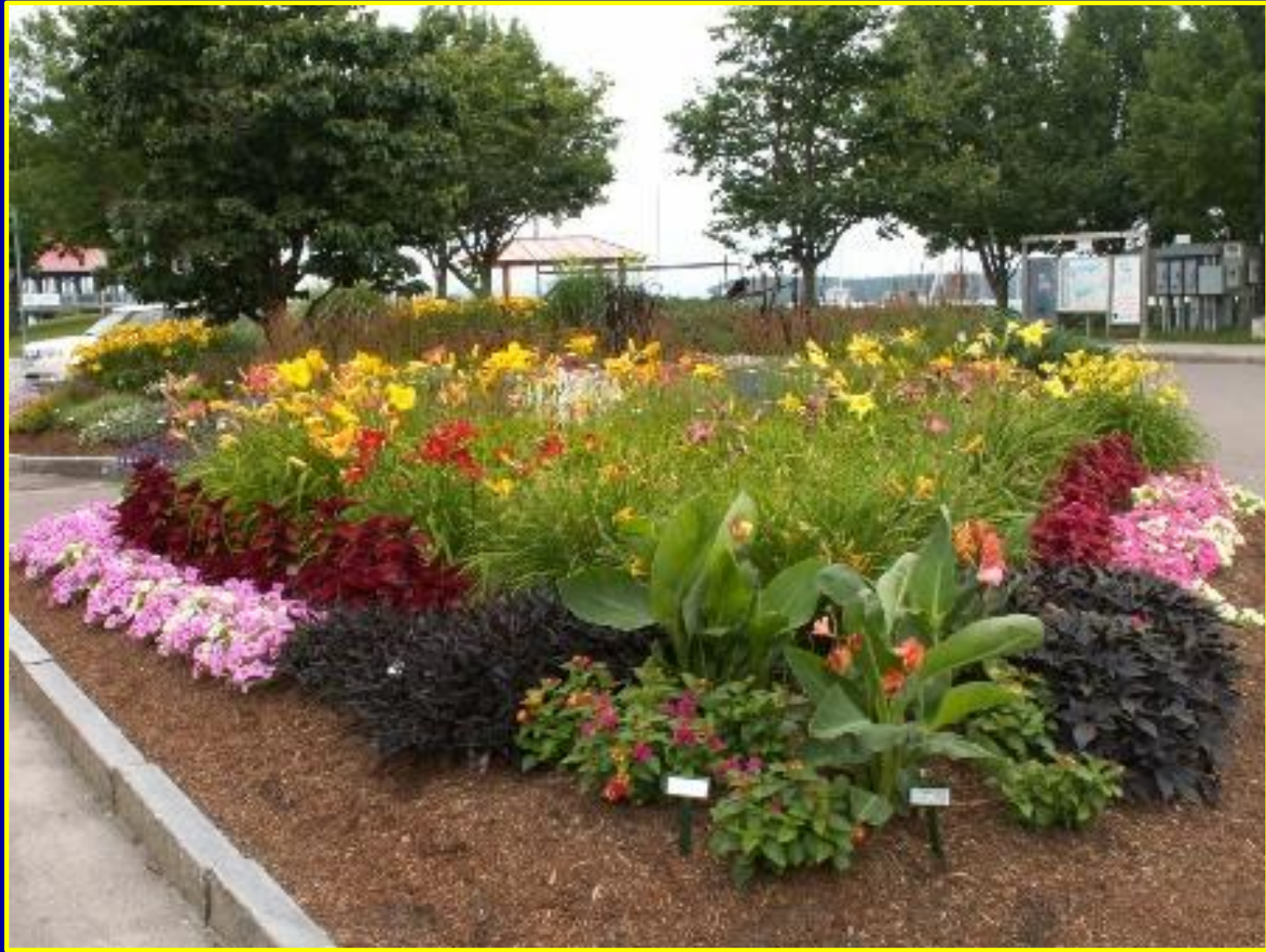
Front bed 2009 July