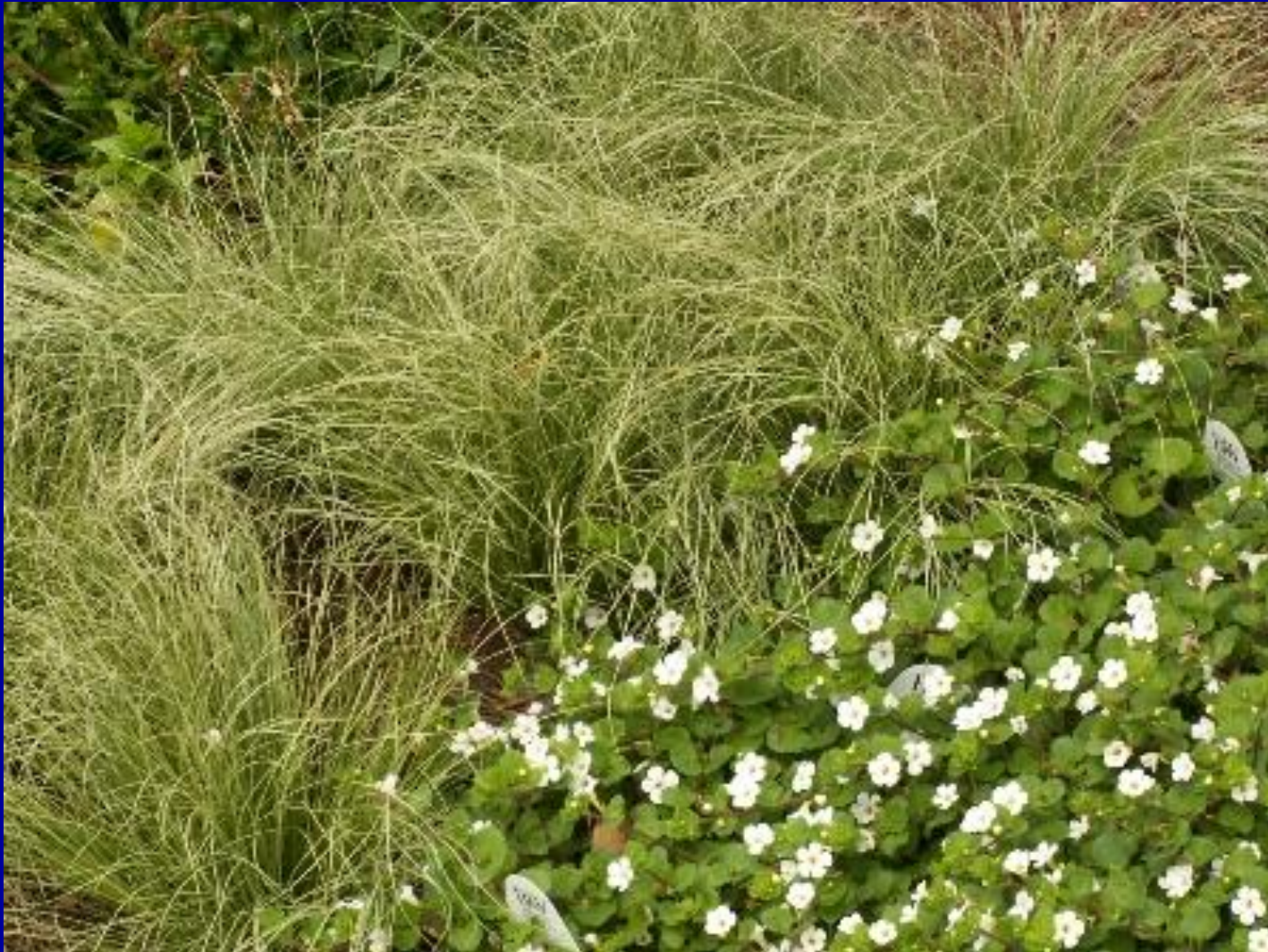
Frosted Curls sedge, Sutera (Bacopa)