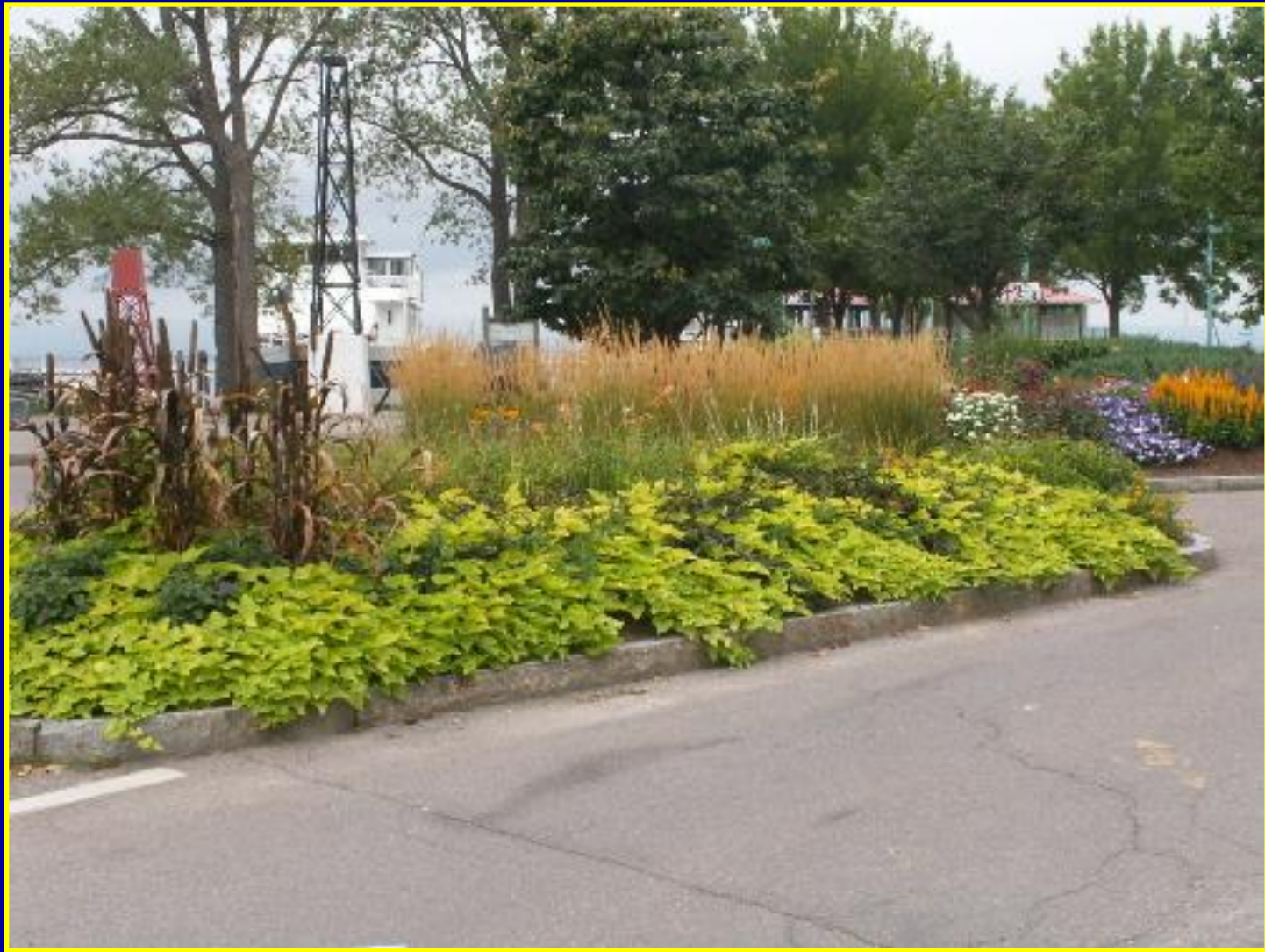
Front bed 2007