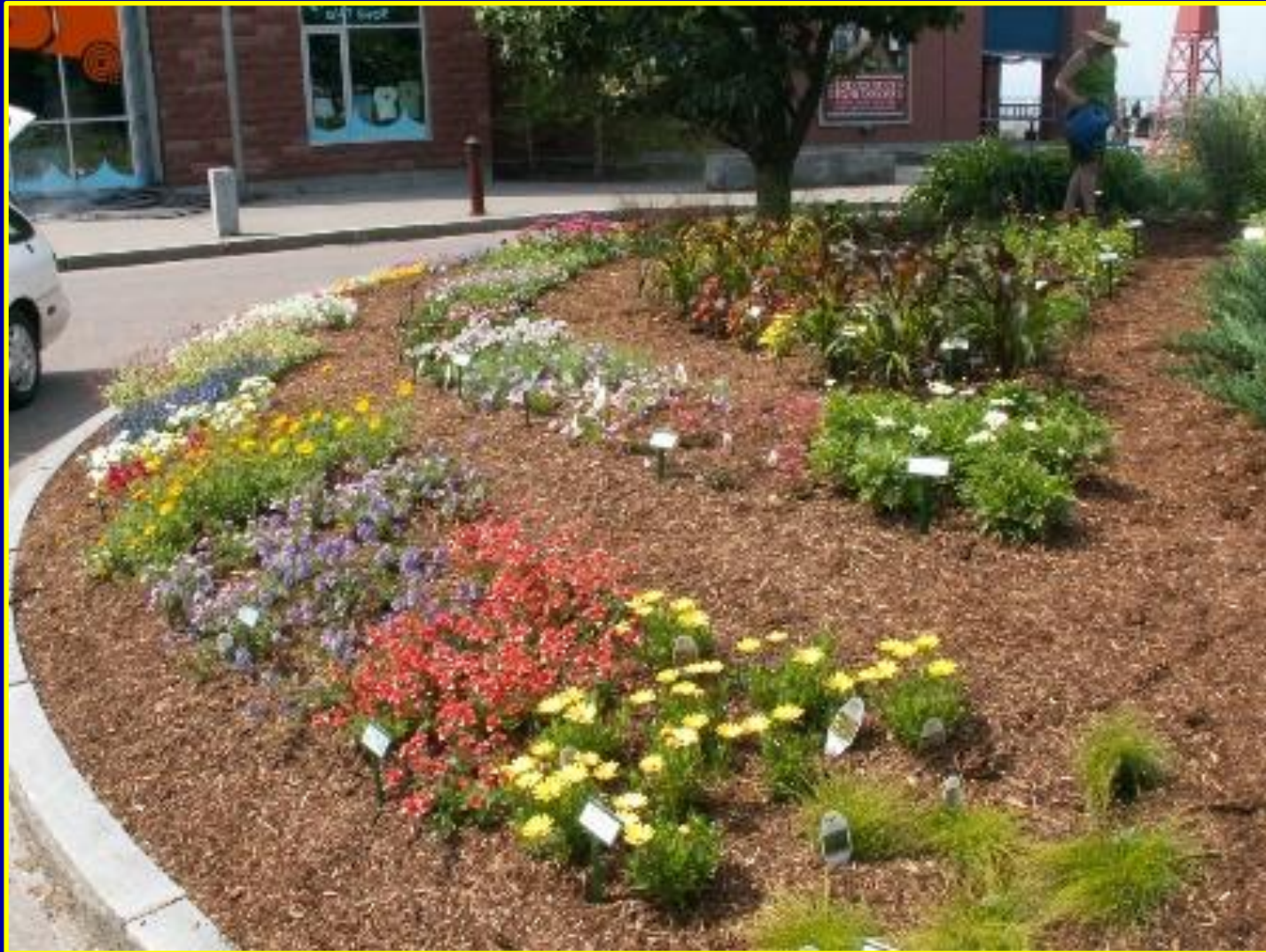
At planting, June 2009