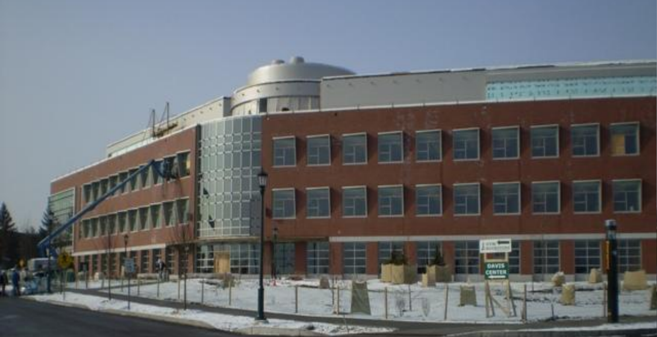
Jefford's Hall, May 2010 opening Plant sciences, plant biology