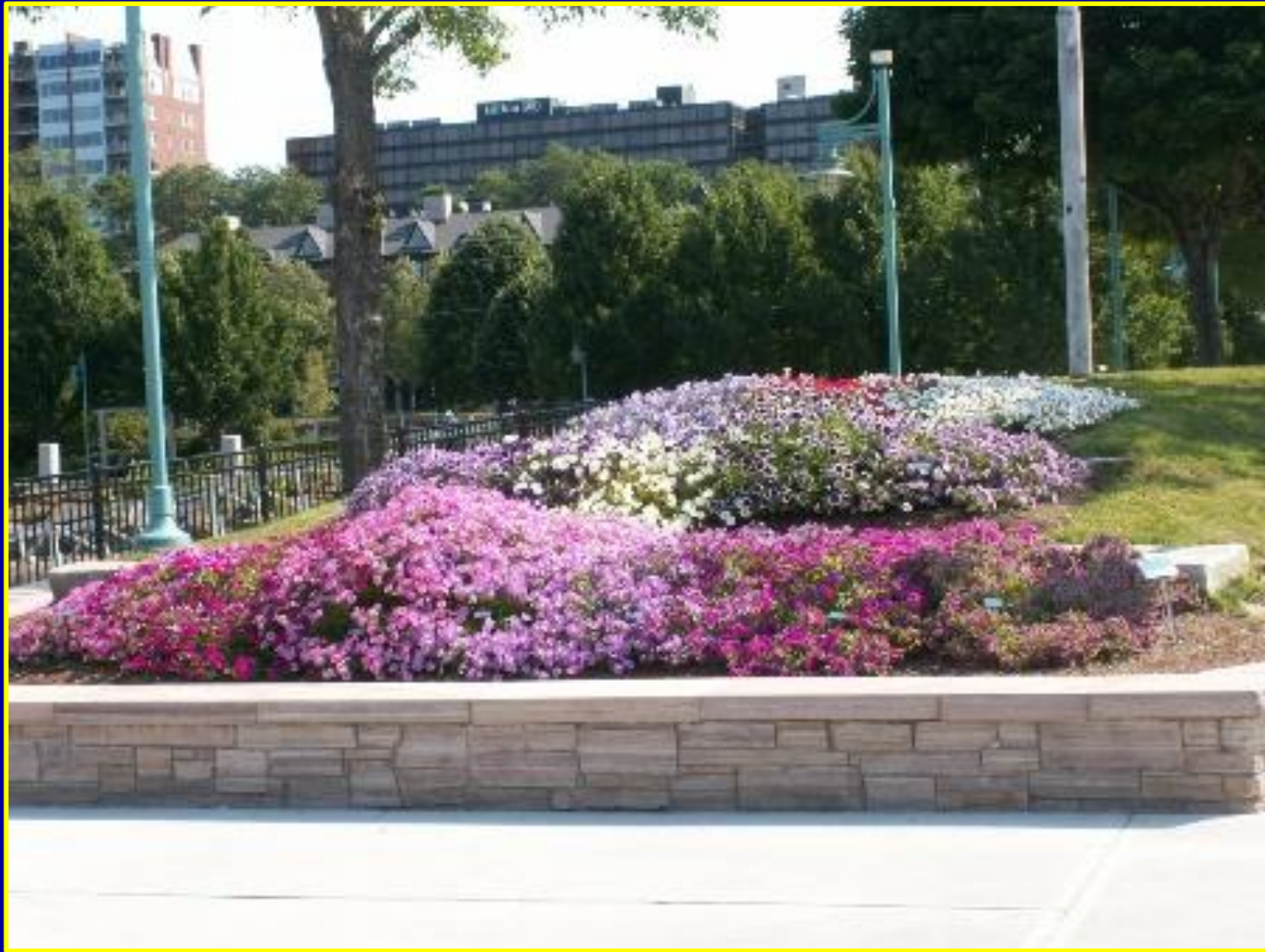
Boathouse beds, August 2009