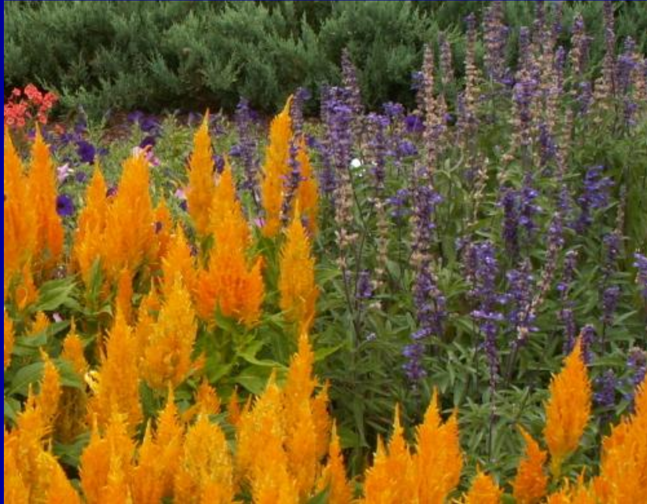
Celosia 'Fresh Look Gold' (2007), Salvia 'Evolution' (2006)