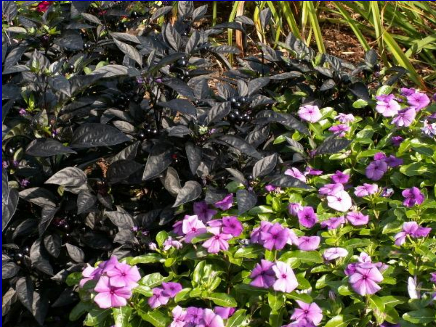
Ornamental Pepper 'Black Pearl' (2006)