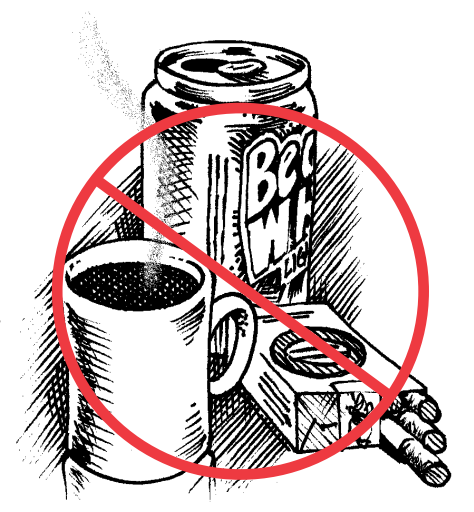
Avoid alcohol, cigarettes and coffee in cold outdoor weather.