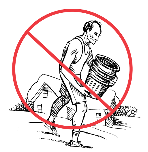
Always dress appropriately in cold winter weather.