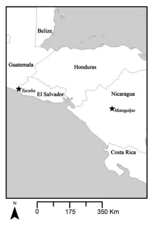
Figure 2 Location of Tacuba, El Salvador, and Matagalpa, Nicaragua.

and soils are predominantly volcanic Andisols (MARN 2003). The cooperatives were located in or near the buffer zone of El Imposible National Park, one of the largest protected natural forests in the country.