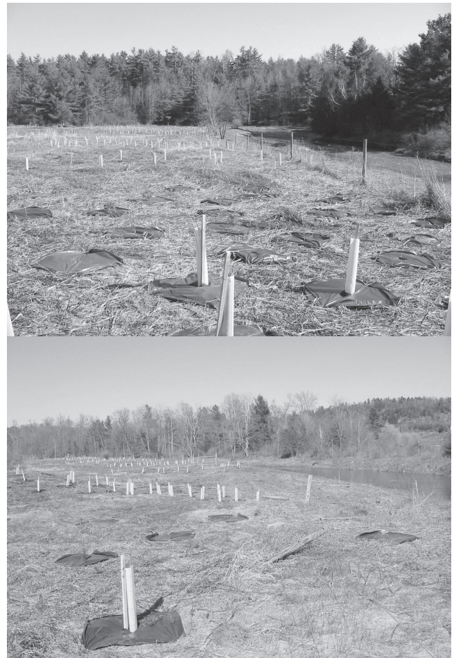
Figure 1. Photographs of the Lewis Creek restoration site after planting. Note the alternating pattern of square treatment units, with half of each unit using tree shelters. Shown are nonoverlapping perspectives along two different sections of the 0.5-km stream reach.

The project was conducted for the Lewis Creek Association, a community-based watershed organization that works cooperatively with private landowners to restore riparian buffers. Restoration sites are identified annually from a pool of candidate sites on the basis of