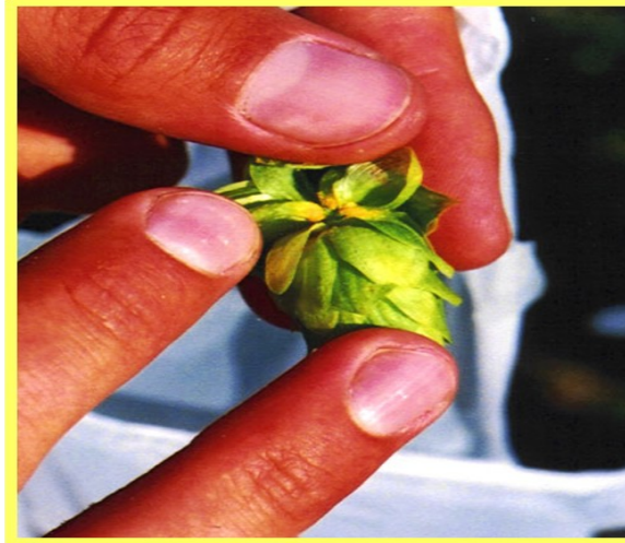
Foothill Hop Farm