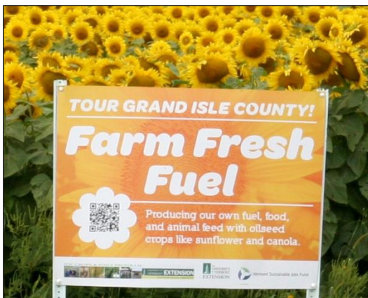
Figure 2. Signs inform curious passersby.

Results in this pilot year were varied. Due in part to the experimental nature of the project, there were some early obstacles and learning curves to overcome. It was difficult to properly time the termination of a previous crop and the establishment of sunflowers, since many farmers and custom operators were busy getting their first cut of hay in and their corn planted at the same time. Operators' planters and sprayers had to be cleaned and calibrated specifically for sunflowers, and the minimal acreage of the Farm Fresh Fuel project made logistics difficult. Fields that were sprayed, adequately fertilized, and planted properly and at the right time yielded much better than others. In addition, fields with wet soil conditions and poor drainage saw yield drags. There were also issues with pest management; deer and birds wreaked havoc in a handful of fields.