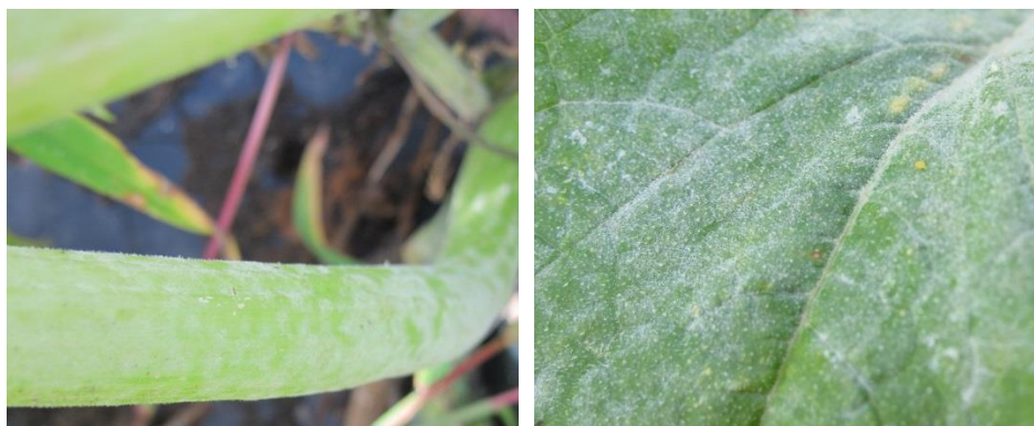
Image 1. Powdery mildew on squash stem (left) and leaf (right), Alburgh, Vermont, 2016.

Powdery mildew grows well in environments with high humidity and moderate temperatures and can be problematic on crops in the Northeast. Cucurbit crops face powdery mildew and often downy mildew on a yearly basis and significant yields losses have been reported. The family of cucurbits is an important part of the diversified crop mix of a typical commercial vegetable farm in Vermont and throughout the Northeast. Growers have been using cultural practices, fungicides, and multiple plantings to mitigate crop loss from powdery mildew, however, the impact of the disease is seasonally dependent and still represents a consistent loss.