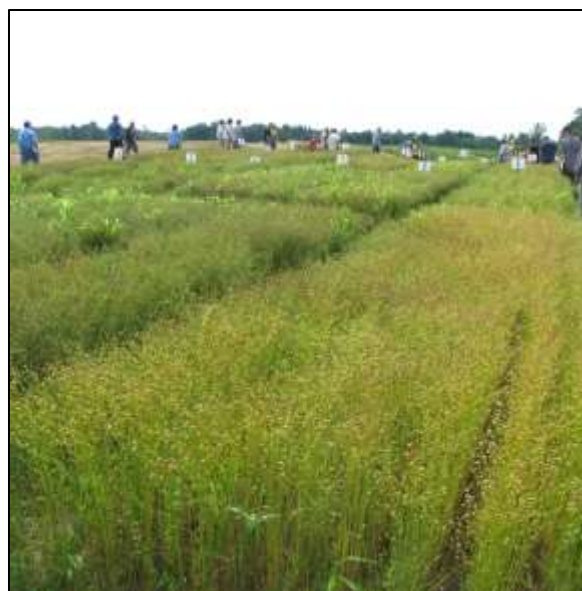
Figure 1. Flax plots on 1-Aug, Alburgh, VT.

NS – No significant difference amongst varieties.