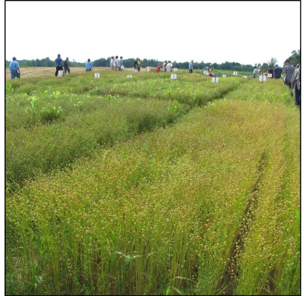
Figure 1. Flax plots on 1-Aug, Alburgh, VT.

NS – No significant difference amongst varieties.