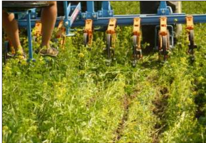
Figure 1. Schmotzer hoe cultivation between rows of wheat.

In addition, the plots with nine-inch row spacing were cultivated with a Schmotzer inter-row hoe on 24-June. The Schmotzer hoe, imported from Germany, is a manually-guided, rear-mounted implement that can be used to cultivate in between wide rows of wheat (Fig. 1). This allows weed control to take place later in the growing season, after plants are well established.