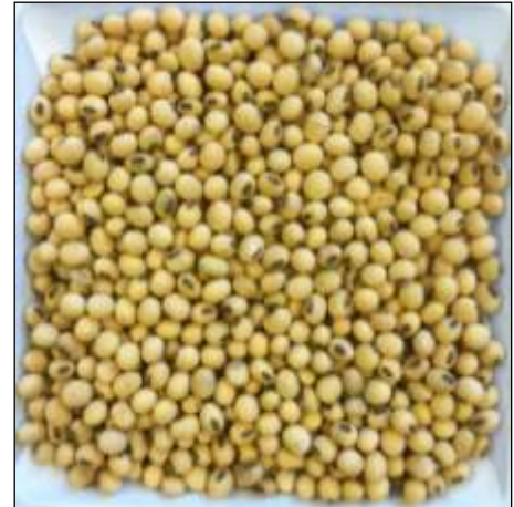
Figure 1. Dark-hilum soybeans.

In 2011, an organic soybean variety performance trial was conducted at Borderview Farm in Alburgh, VT. Several seed companies submitted varieties for evaluation (Table 1). The soybean varieties were considered early maturing, with maturity groupings between 0.6 and 1.8. Soybeans with maturities above early group 2 cannot typically be grown in Vermont. Both dark hilum and light or clear hilum varieties were included in the study (Figure 1). Light hilum varieties are typically grown for culinary uses, since the dark hilum can stain food and oil products and render yields unmarketable. Both types can be used for livestock feed, and food-grade soybeans that do not meet standards often become feed.