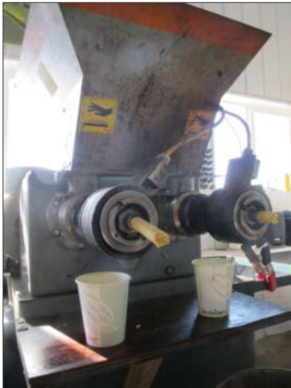
Figure 2. Kern Kraft KK40 press used for soybeans.

On 8-Feb 2012, subsamples from each plot were pressed with a Kern Kraft KK40 oil press (Figure 2). The press was fitted with "hard seed screws" and operated at a constant high temperature (175° F) and approximately 45 RPM. Oil content was calculated based on seed sample weight and final oil weight.