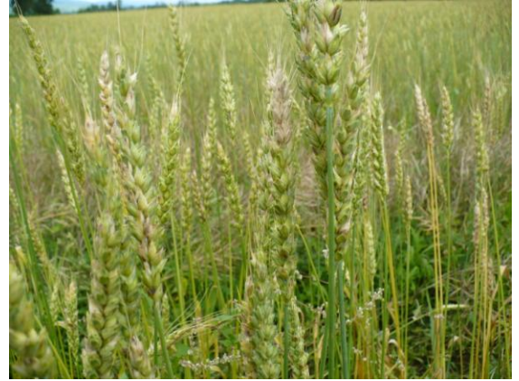
Image 5. Wheat with Fusarium Head Blight