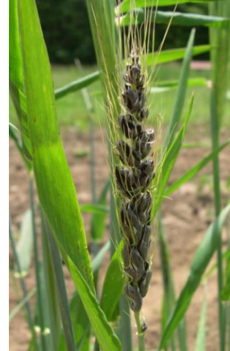
Image 3. Loose smut infected head

HWS9258J was the highest yielding spring wheat variety at 4098.7 lbs ac -1 while AC Walton was the lowest with 1426.1 lbs ac -1 . The yields were significantly different (Table 5 and Figure 2). There was a considerable amount of bird damage in the spring wheat trials. In the taller varieties (AC Brio & Walton) the birds, by landing on the wheat, would cause them to lodge. Wheat varieties with awns appeared to have advantage over varieties without awns. The Durum wheat, which was significantly shorter, suffered less bird damage but had higher weed pressure. The test weights of varieties were significantly different; Glenn wheat had the highest at 62.0 bu ac -1 while the lowest was SD7006J. Both of the Durum wheat varieties, SD 7006J and Hallmark, had the lowest test weight values. There was no significant difference among varieties in grain protein levels. We observed more plant disease in the spring wheat this season. Ergot and Fusarium Head Blight, Fusarium graminearum (sexual stage, Gibberella zeae ) were found in all of the varieties, and Loose Smut, Ustilago tritici , was observed on the Glenn wheat (Image 3).