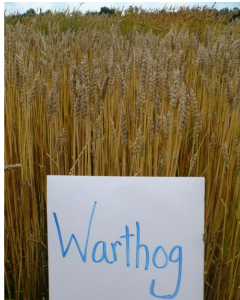
Image 1. Winter wheat prior to harvest

The highest yielding variety was Harvard at 4792 lbs ac -1 , while Maxine had the lowest yield at 3035 lbs ac -1 (Table 4, Figure 1). The winter wheat plots suffered minimal bird damage. The spring wheat harvested almost 3 weeks later was severely impacted by the birds. Plant height was significantly different between varieties; the tallest was Borden at 54.5 inches and the shortest Harvard at 40.5 inches. Lodging was an issue in the Borden plots. We did not observe severe weed pressure in the winter wheat trial. Many of the plots were frost seeded with clover which reduced the weed populations (Image 2). The crude protein (CP) levels were significantly different between varieties. Zorro had the highest CP at 15.2% and Harvard