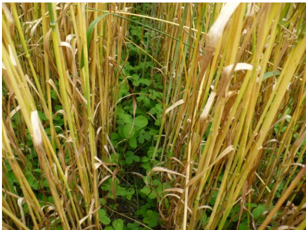
Image 2. Clover frost seeded into winter wheat