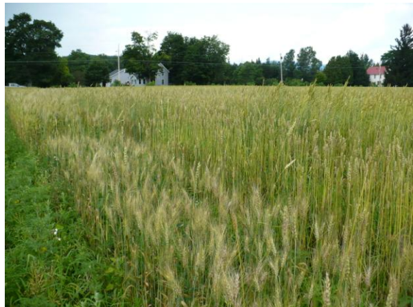
Image 4. Heirloom plots differing in height and awns.

The highest average yield was Surprise with 1611.8 lbs ac -1 while AC Norwell was the lowest yielding at 680.6 lbs ac -1 (Table 7). Weeds, especially Wild Mustard, severely impacted plots at this site. The weeds were so prolific that it was necessary to hand weed the trial area three times throughout the season. The most prevalent plant disease found at the North Troy site was Fusarium Head Blight (Image 5). Bird damage was not an issue at this location.