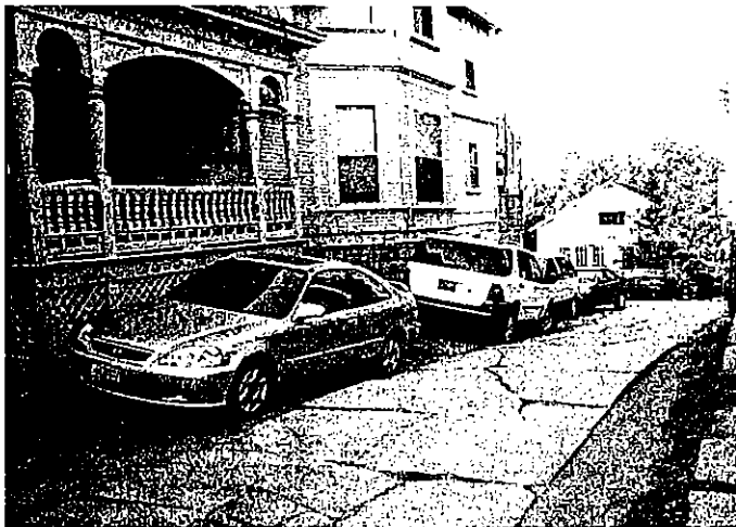
Cars parked on what used to be lawn adjacent to 44 S. Willard Street. The green space has been so heavily compacted that rainfall can no longer soak in.

Zoning or not, like it or not, green space is disappearing from Burlington's Hill Section. Take a walk down Willard Street. Most days you'll see 3, 4, 5 cars parked squarely on lawns. Look harder and you'll see driveways that were once a single car width but now hold six or eight cars, the wheels of which spill onto muddy ruts either side of the pavement. You'll see sidewalks now used for parking spots and whole back yards covered in gravel.