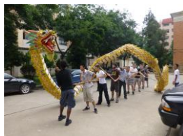
Students from UVM are learning the dragon dance from students at Yunnan University in China.