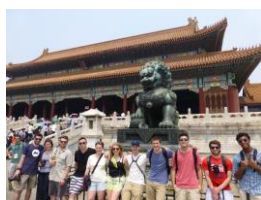
UVM students participating in the 2014 Study Abroad Program in China are visiting the imperial palace, which is the Palace Museum now, in Beijing.