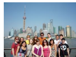
UVM students on a study tour in Shanghai in May 2010. They visited 2010 Shanghai World Expo. This year, 15 students participated in the Study Abroad Program in China.