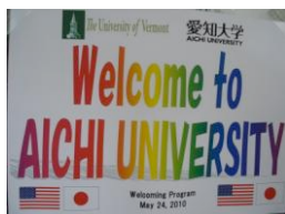
A sign made by Aichi University to welcome UVM students in May 2010.