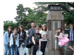
Students at Aichi University

and staff, the UVM students taking the trip had a wonderful time learning about the campus life and the lifestyle of Japanese college students. □