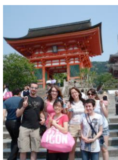
UVM students taking the cultural trip to Japan are in front of Kiyomizu Temple in Kyoto