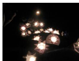
Flower lanterns are set floating near University Heights during the moon festival.

At the party, students tasted moon cakes and made some floating flower lanterns. They then went