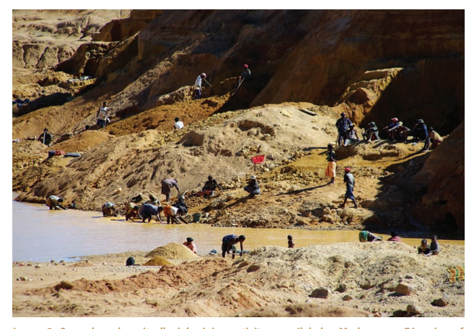
Image 2. Secondary deposit alluvial mining activity near Ilakaka, Madagascar. Diversion of watercourses, slope instabilities, and scarring of landscapes are the main environmental impacts.

In a sector that includes over 50 producing countries, a multitude of cultures, environments, geologies, and minerals, it is no overstatement to suggest that the situation is complex. Although a number of large-scale and medium-scale mining companies operate, colored gemstones