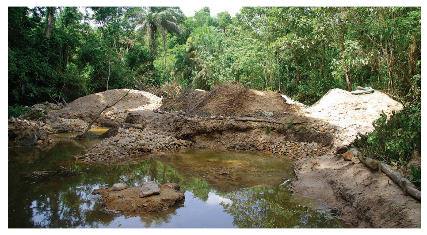
Image 1. A testament to past gemstone mining activity: deforestation, pits, habitat changes, and stagnant waters.