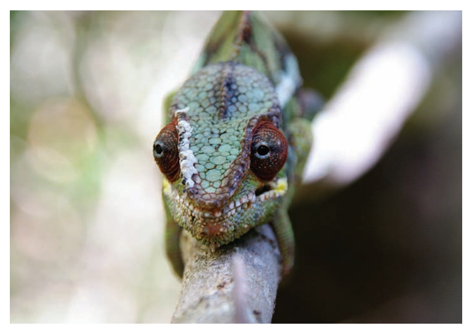
Image 4. What consequences does gemstone mining have on disappearing fauna and flora in vulnerable ecosystems as a result of changes to their habitats?

In the face of these problems, solutions may seem elusive and vague. But one concrete and crucial aspect that stakeholders at all levels could and should think about is the reclamation and remediation of the tens of thousands of unfilled pits that riddle the globe. Considering that many are the result of unlicensed mining activity, there are no longer actors that can be held accountable for these consequences. Remediation costs both time