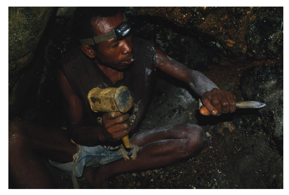
Image 3. Underground mining in a primary corundum deposit. Chiseling in such mica-rich layers presents an important environmental health risk for workers due to resulting dust that contains fine silicate particles.

once they have ceased to operate to reduce risk for local populations.