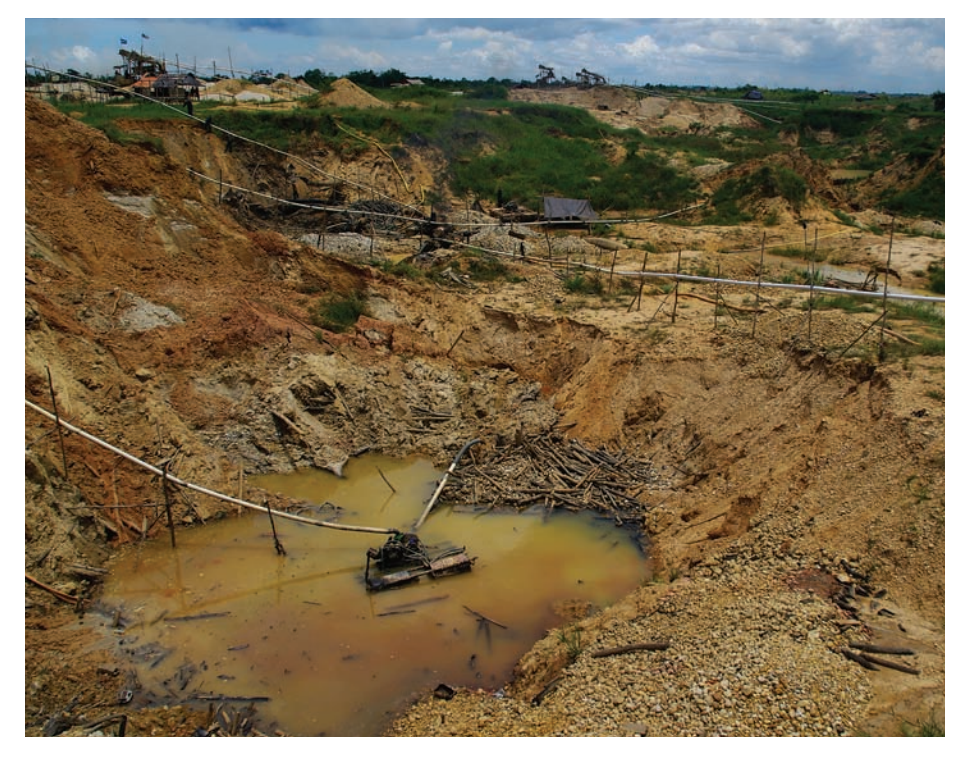
Image 5. Scene of environmental destruction as a result of artisanal small-scale mining. Environmental impacts include excessive use of groundwater, pollution through diesel discharge, deforestation, and subsequently unreclaimed pits.

Environmental complexities are inextricably interwoven with environmental health and socio-economic realities (Kit-