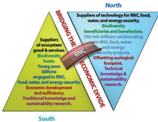
Figure 1. RNC: Crossing the economic development divide. (In color in Annals online.)

In general, the problem does not lie in failure to generate information, such as that contained in the Millennium Ecosystem Assessment 2 and the TEEB reports, 3 or to “make it available.” But “making information available” is not the same thing as communicating it. Rather, resolving the problem requires the changing of mindsets through more integrated communication of ecological economics. Such a major paradigm shift will require leadership at all levels. It will also require financial mechanisms, both dissuasive and incentive in nature.