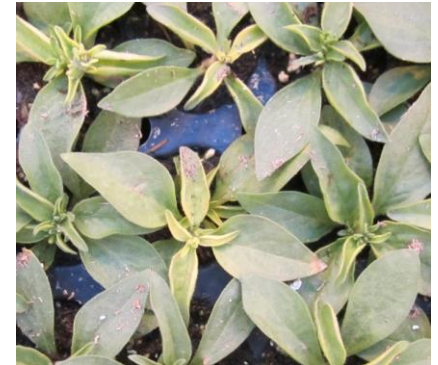
Figure 1. Stunted and chlorotic petunia resulting from high media pH (>6.2) and low fertilizer.