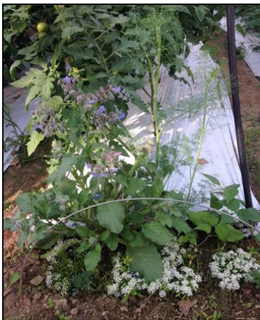
Habitat plants in tomatoes.

Aphids are the #1 pest of vegetables in Northeastern high tunnels. To combat them, some growers spray chemical insecticides, which pose a threat to human health and the environment. Organic growers either do nothing, or spend a lot on frequent releases of natural enemies. Plant-mediated IPM systems (e.g., trap, banker, and habitat plants) offer innovative ways to manage aphids and other pests in high tunnels. These plants provide pollen and nectar to natural enemies in the absence of their pest prey. For 3 years we have been evaluating these IPM systems in year-round high tunnel vegetables (summer crops and winter greens) in Maine, New Hampshire, Vermont and Pennsylvania to determine if they support and enhance populations of beneficial insects. Alyssum, beans, marigolds, borage and dill were tested as habitat plants during the summer; whereas alyssum, beans, marigolds, calendula and viola were used during the winter. To date, over 2,500 natural enemies were encountered on habitat plants. Most common were parasitic wasps and their mummies, Orius and syrphid adults. The greatest abundance and diversity of natural enemies were observed on alyssum, borage and dill. Alyssum had the greatest tolerance to extreme heat and cold conditions, flowered throughout most of the growing season and