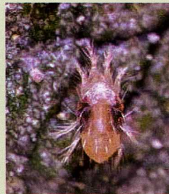
Two-spotted spider mite adult.