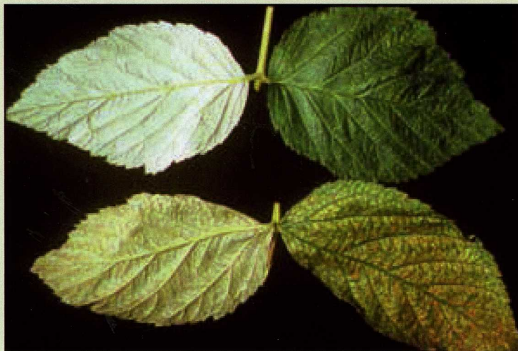
Top: Healthy leaves. Bottom: Leaves with mite damage. Note the yellowing and blotchy appearance.