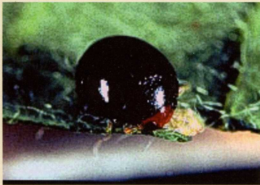
Delphastus (0.06 in. long) feeding on whitefly.

Adults and larvae of this ladybeetle attack eggs and nymphs of greenhouse and silverleaf whitefly, consuming up to 10,000 eggs over its life. Adults are shiny black with a reddish orange head; larvae are pale yellow. Adults are strong fliers, detecting prey by smell. Females must eat 100 prey daily to reproduce, so beetles will not persist without the host. Beetles recognize and avoid parasitized whiteflies, so they can be used together with parasitic wasps ( Encarsia and Eretmocerus ).