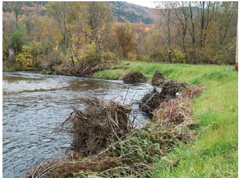
Channel restoration project on the Upper White River, VT