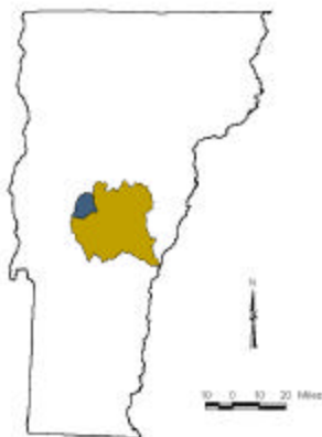
Upper White River basin (shown in blue) within the White River watershed (shown in brown), Vermont.