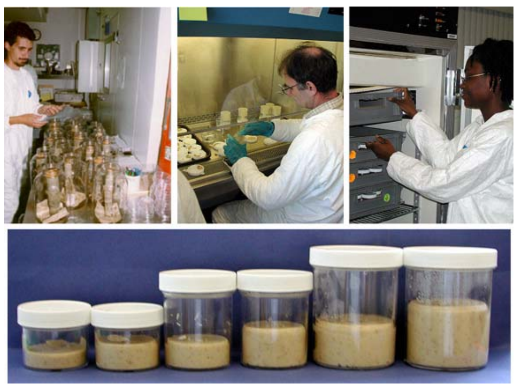
Quarantine facility in Ansonia, CT