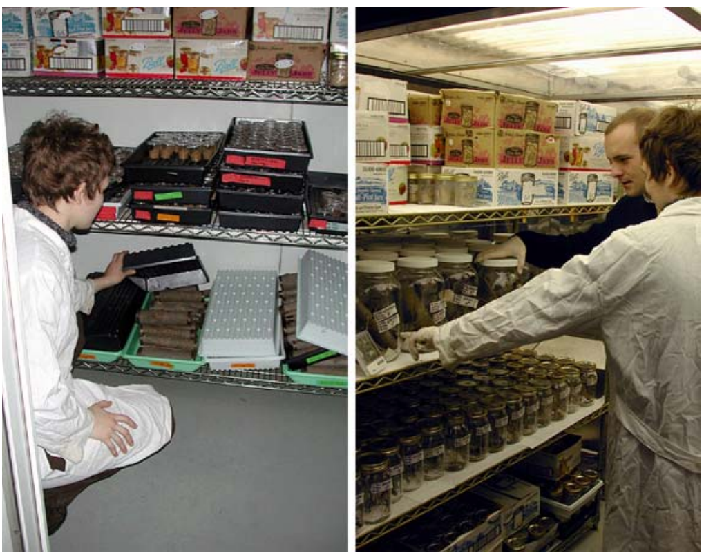
Quarantine facility in Ithaca, NY