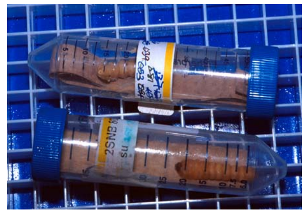
Prepupae in tubes

pupae at 20°C than at 25°C. Methods for retrieving and holding prepupae and pupae developed at Ansonia greatly reduced eclosion abnormalities that occur when larvae pupated in the diet or were exposed to low humidity. Additionally, methods for holding adults in use at Ithaca and Ansonia have increased survival time and curtail aggressive behavior. Because some late instar larvae stopped developing and did not resume development until after a cold period, research continues at both Ithaca and Ansonia to determine ideal conditions and durations of chill.